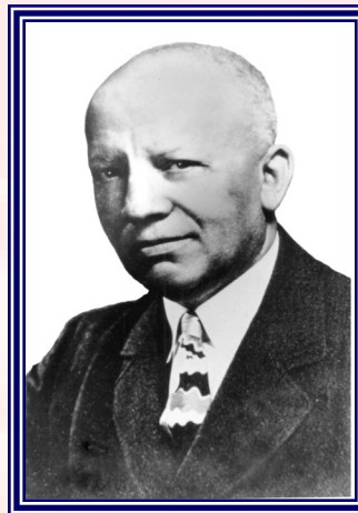
Carter G. Woodson, 'Father of Black History Month'

Life and History , and a year later founded the widely respected Journal of African American History (formerly the Journal of Negro History ). "Negro History Week" was intended to bring national attention to black people's contributions throughout